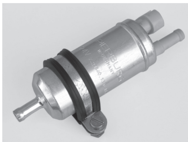
View of E1F